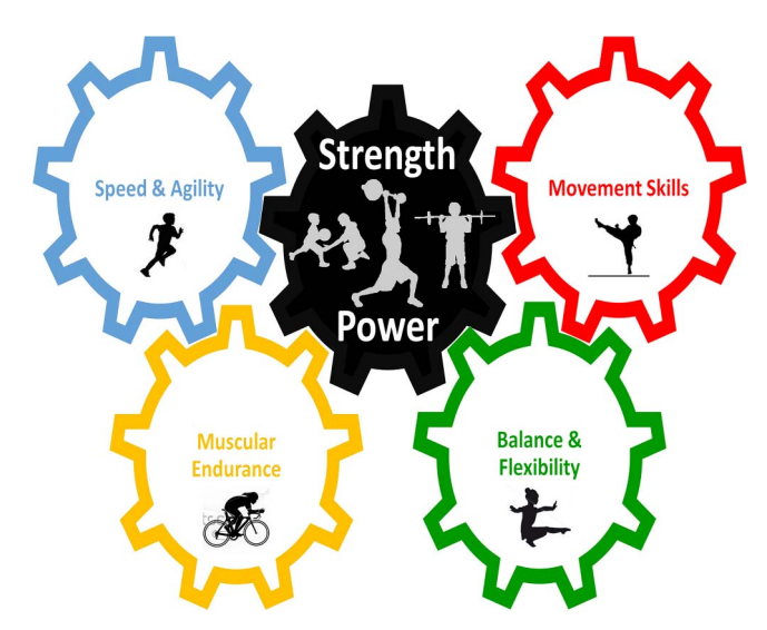
Figure 1 The driving influence of strength and power on parameters of athletic performance.

Enhancing the physical literacy of youth to improve athletic prowess is not a novel concept. 44 However, an evidence-based approach to long-term physical development must include resistance training given its proven performance enhancing benefits. 1 4 43 In addition to enhancing muscular strength, regular participation in a progressive resistance training programme for 2 years improved sprint speed up to 6% in elite youth soccer players compared to a group of age-matched players who participated only in regular soccer training.<sup>45</sup> Others reported favourable changes in performance measures in age-group swimmers, 46 preadolescent rhythmic gymnasts, 47 and adolescent basketball, 48 handball 49 and tennis players 11 following resistance training. Of potential relevance is that researchers monitored strength performance on the front and back squat exercises in 141 elite youth soccer players over 2 years and determined possible reference values in strength performance for these athletes.<sup>50</sup> These researchers suggested that relative strength (ie, 1 repetition maximum (RM)/body weight) in parallel squat performance for young soccer players and other athletes with resistance training experience should range from 0.7 for 11 to 12-year olds, 1.5 for 13 to 15-year olds, and 2.0 for 16 to